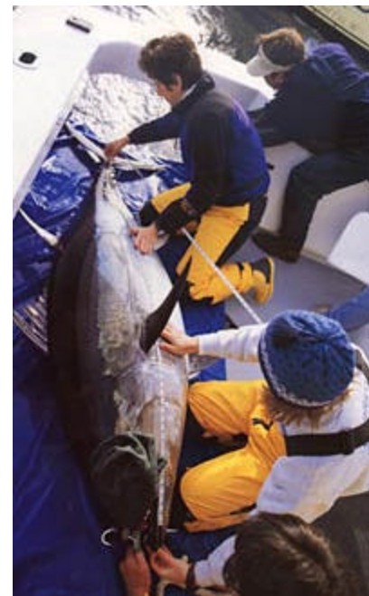
Researchers measure and tag a bluefin tuna off the North Carolina coast before releasing it to learn more about these massive fish.