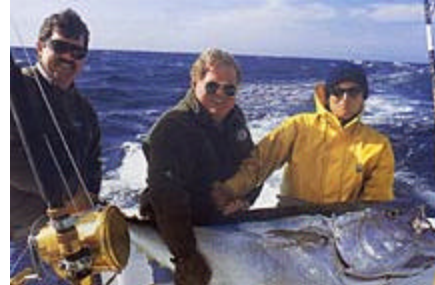
A group of anglers hold a bluefin taken after a day of fishing off Cape Hatteras.

Researchers hope the data obtained through the tagging program will reveal the travel patterns of Atlantic bluefin tuna, which have been the subject of much debate. Also in question is whether there are one or two stocks of Atlantic giants. These two pieces of information are considered vital to manage the tuna fishery, which is believed to be collapsed on the western side of the Atlantic and nearly so on the eastern side. ICCAT, a coalition of 25 nations, currently manages the Atlantic bluefin tuna fishery as two stocks. The western stock includes tuna found off the coast of New England down to the Carolinas and into the Gulf of Mexico. The eastern stock includes primarily the Mediterranean. Management of the stocks is separated by an imaginary line that runs through the Atlantic Ocean at 45 degrees longitude.